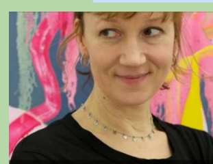
Black History Month